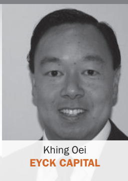
Khing Oei EYCK CAPITAL